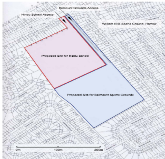
PROPOSED SITE - THE PROPOSED SCHOOL OCCUPIES UP TO HALF OF THE SITE