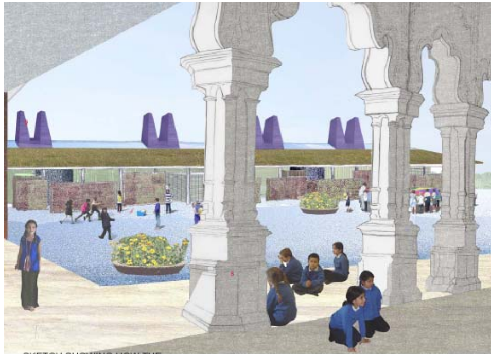
SKETCH SHOWING HOW THE SCHOOL MIGHT LOOK

NEW HINDU PRIMARY SCHOOL PRELIMINARY PROPOSALS