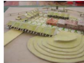
DEVELOPMENT MODEL LOOKING AT OPTIONS FOR THE THE SCHOOL